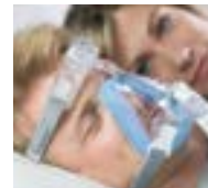
AmaraGel full face mask