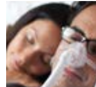
Wisp nasal mask