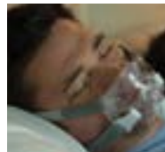
AmaraView full face mask