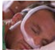
DreamWear under the nose nasal mask

With innovative cushion designs for excellent seal and comfort, our Philips Respironics masks are helping CPAP users get the sleep they deserve.