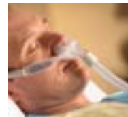
Nuance and Nuance Pro pillows mask