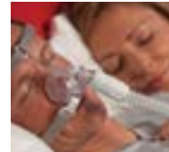
Pico nasal mask